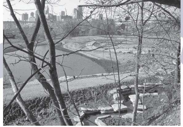
A view of the Bruce Vento Nature Sanctuary, created through the work of more than 20 organizations, including FMR.

For river enthusiasts, this little park heralds big riverfront changes to come. The Edgewater site is part of the larger vision for Minneapolis' Upper River area set forth in "Above the Falls: A Master Plan for the Upper River in Minneapolis." The Above the Falls plan, which covers Minneapolis' riverfront north of Plymouth Avenue, involved a broad cross-section of the communities it serves. The award-winning plan emphasizes eco-friendly amenities, continuous parks and trails along both sides of the river and improved community-to-river connections.