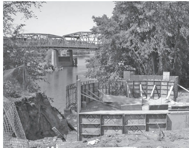
Construction of a Mississippi River overlook was underway this summer at the new Edgewater Park in northeast Minneapolis. In addition to great views, park visitors can enjoy trails, plantings, innovative stormwater treatment features and a restored shoreline.

That said, first visitors may be treated to the occasional sounds of construction. While trails, which mimic the river’s wending ways, have been completed, work on the circular riverfront plaza they lead to is currently in progress. And