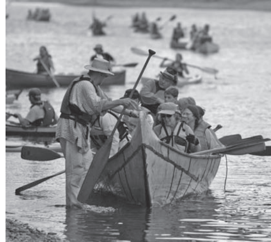
Above: A bird's eye view of paddlers in the gorge area of the river; and voyageurs climb out of their boat at a rest stop. Below: Paddlers leave Lock and Dam No. 1 on the first day; and Minneapolis Mayor R.T. Rybak greets visitors at Islands of Peace Park.