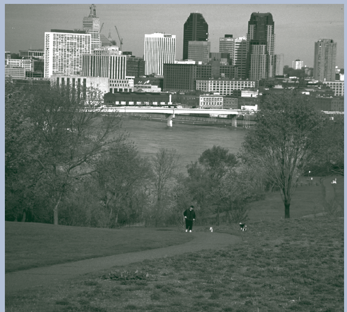
A Task Force is hard at work identifying a long-term plan for Mounds Park, which presides over an iconic blufftop location along the Mississippi River.

Finally, the Great River Park Master Plan is the city's overarching effort to put detail into the citywide master planning efforts. The plan seeks to create a park that is "more urban, more natural and more connected", and will help shape some of the large-scale transportation, recreational, and ecological systems.