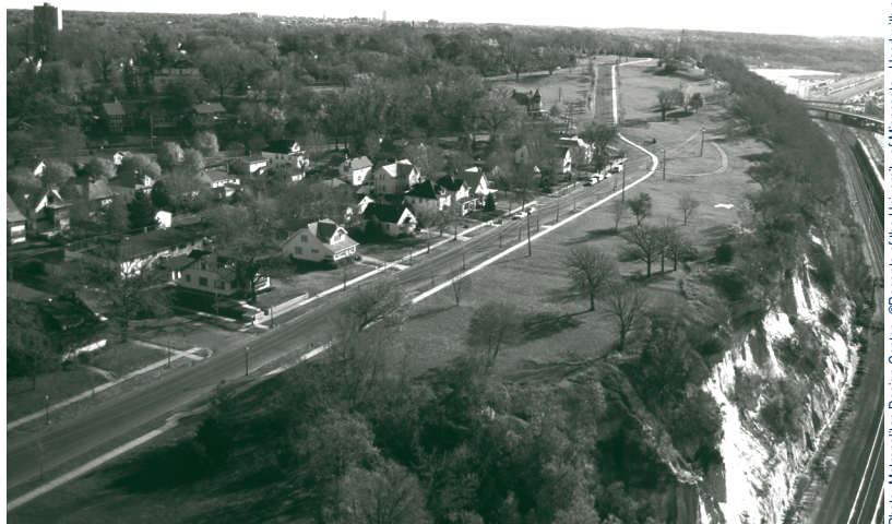
Mounds Park in Saint Paul. The 19th Century planners in the Twin Cities recognized the value of the Mississippi River as a commons in need of protection. The public parks and parkways along the river and bluffs have provided a beloved community treasure that is accessible to all.