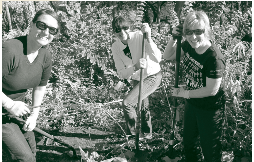
ABOVE: Volunteers from Aveda Corporation removed invasive plants from a section of Riverside Park to prepare it to be planted with native species, September 29, 2010. Photo: Karen Solas/FMR

RIGHT: Volunteers pose proudly next to the pile of buckthorn they removed from Riverside Park on May 15th. Photo: Karen Solas/FMR