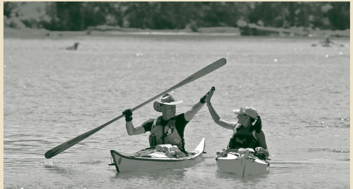
Two paddlers congratulate each other for successfully finishing the 2010 Mississippi River Challenge.

Stay up to date on the Mississippi River Challenge by becoming a fan on Facebook and by following @MissRivChall on Twitter.