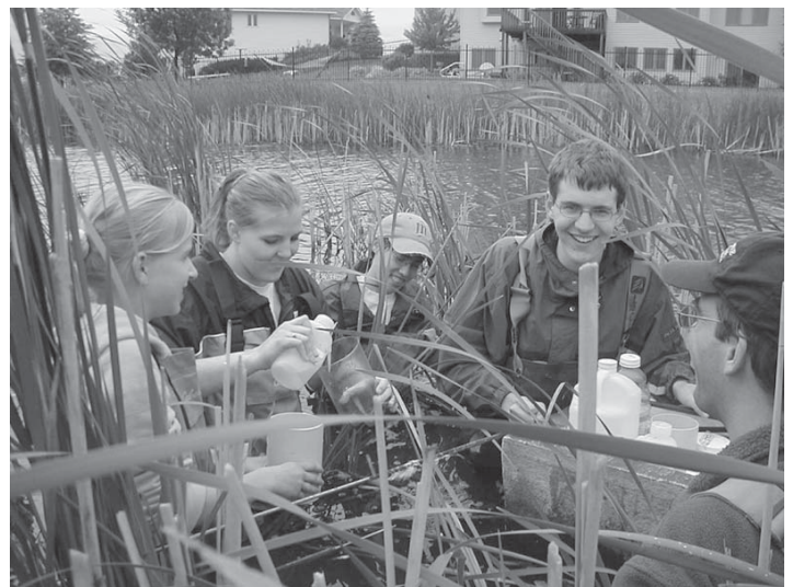
Volunteers enjoyed getting into deep water for a Wetland Health Evaluation Program (WHEP) training this past Spring.

For more information on the Pine Bend Bluffs Scientific and Natural Area, please visit www.fmr.org/pbptnrs/ .