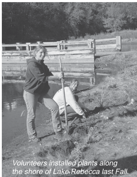
Volunteers installed plants along the shore of Lake Rebecca last Fall.