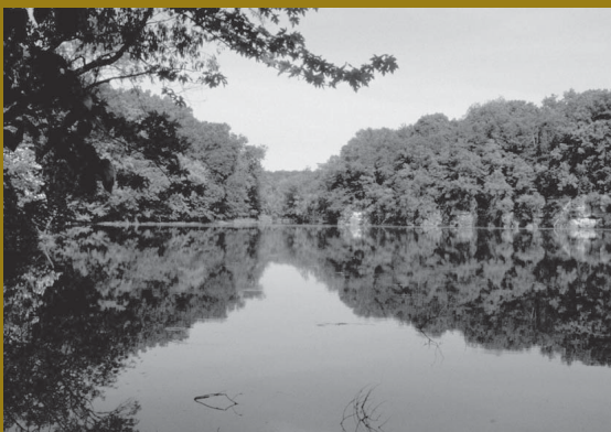
A small backwater bay on the Mississippi in Grey Cloud Island Township is threatened by annexation and a proposal to urbanize the local riverfront.

"It is truly ironic," added Jones, "that citizens of one community are striving to reestablish open space and public access along a stretch of river that has been severely degraded from decades of industrial activity. Meanwhile, just a few miles downstream in a community that is fortunate enough to have a riverfront with rare oak savanna and bald eagle nests, city officials are downplaying the significance of natural habitat at the site in order to proceed with a massive development."