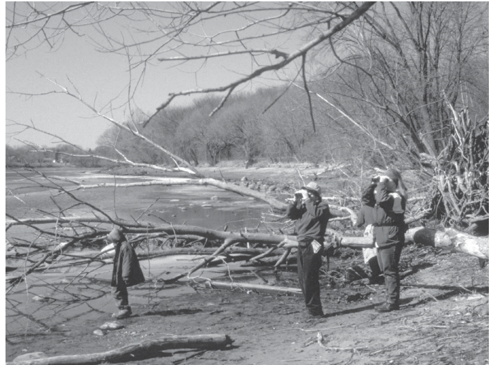
The River Wildlife Watch at Coon Rapids Dam Regional Park will be repeated in March of 2005.

FMR plans to offer more great tours in the future and add interpretive outings to new places, while continuing to offer tours that have remained old favorites such as the Grey Cloud Dunes SNA Wildflower Walk. If you wish to be added to the brochure mailing list, please contact Katie Galloway at 651/22-2193 x14.