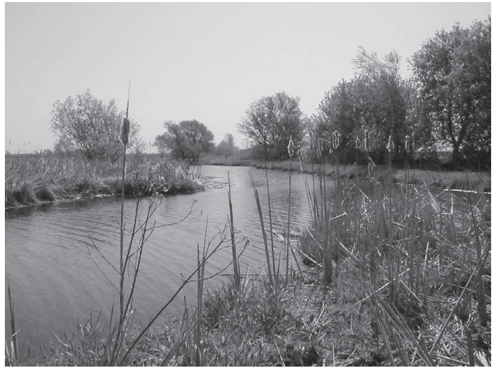
North Creek, a tributary of the Vermillion River, is threatened by increased runoff pollution from rapid urban development.