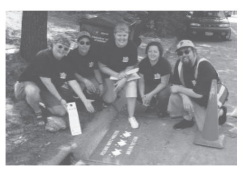
Employees from Whole Foods Market took some time out to spread the word to local residents about how to prevent stormwater runoff pollution

For more information or to get involved, call 651/222-2193 or send an email to ahawkins@fmr.org