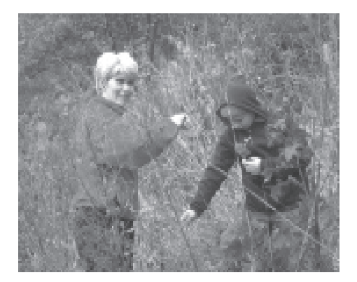
Gorge Stewards collecting seeds from a prairie remnant in the gorge last fall. The seeds were then broadcast as part of an ongoing oak savanna restoration project.

A growing group of dedicated citizens are working with FMR to protect and restore this important community resource through a project called Gorge Stewards. The Gorge Stewards project, which was started through a partnership between FMR and the Longfellow Community Council in Minneapolis, aims to expand