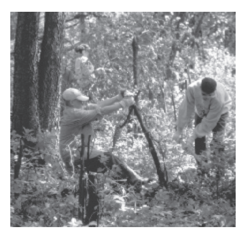
Removing Buckthorn is hard work! Volunteers wrestle with exotic species removal during a Big Rivers Partnership volunteer event at Pine Bend Bluffs.

Two key landowners FMR is working with at Pine Bend make up the "bookends" of this important natural area: Flint Hills Resources (formerly Koch Petroleum Group) and Macalester College. FMR's partnership with Flint Hills includes ongoing extensive ecological restoration on over 100 acres at the southern end of Pine Bend (see sidebar). FMR has also completed a natural resources management plan for the Katharine Ordway Natural