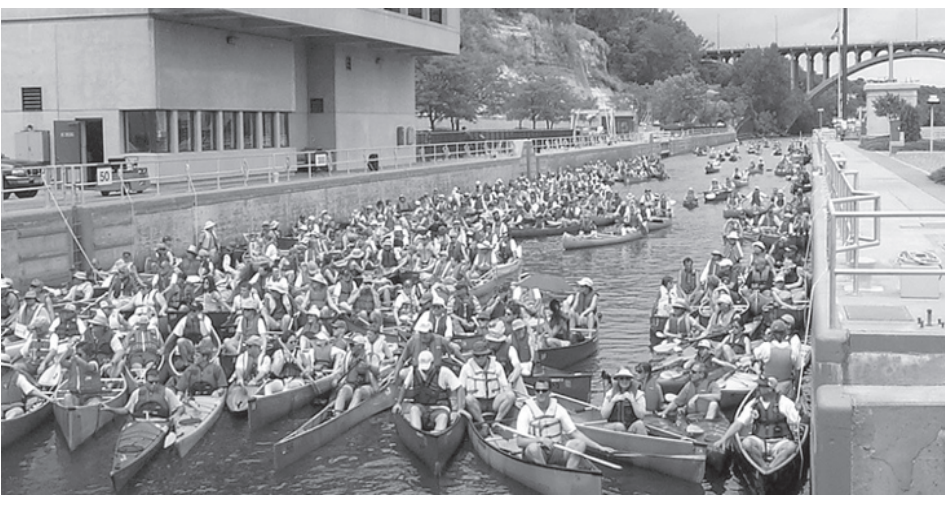
Lock #1 at the 5th Annual Canoe Adventure

FMR now offers outings throughout the winter months, so you can experience the Mississippi with us year round. See the back of this newsletter or visit the web at www.fmr.org to learn how to get involved in upcoming Special Places