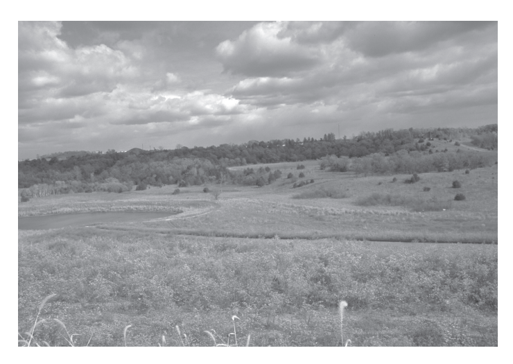
The "Sand Coulee" is one of those rare remaining natural places in Dakota County. A variety of native species and some rare plants reside there, and the landowners are working together to protect and restore this important site.

The American Society of Landscape Architects (ASLA) has awarded the Mississippi River Greenway Strategic Plan a national Merit Award in the Analysis & Planning category of the 2002 ASLA Professional Awards Program. Friends of the Mississippi River and the Hoisington Koegler Group Inc. organized this multi-jurisdictional effort, which developed a greenway plan and opportunity map for the Cities of Hastings and Rosemount and the Townships of Ravenna, Marshan and Nininger, all in Dakota County. The project is highlighted in the November issue of Landscape Architecture . Project partners included the local units of government listed (except Nininger Township), Dakota County, and the Metro Greenways Program of the Department of Natural Resources.