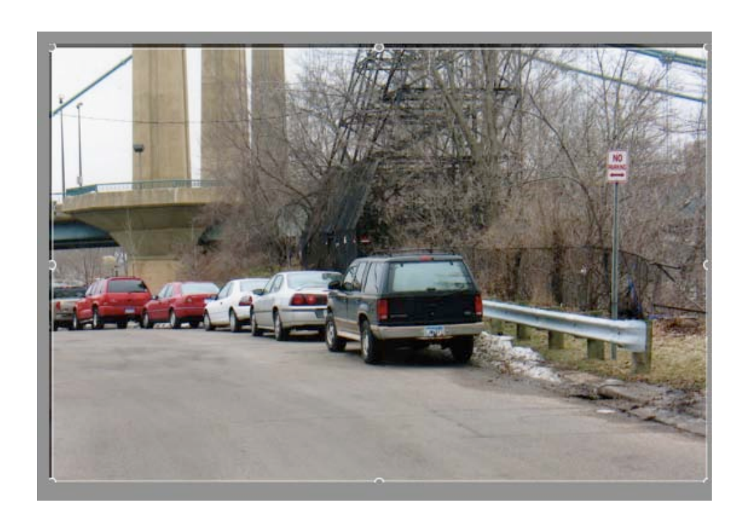
Illegal parking and traffic congestion during an event held at DeLaSalle January 22, 2006

Vehicles parked along the curb turn East Island Ave into a one lane street.