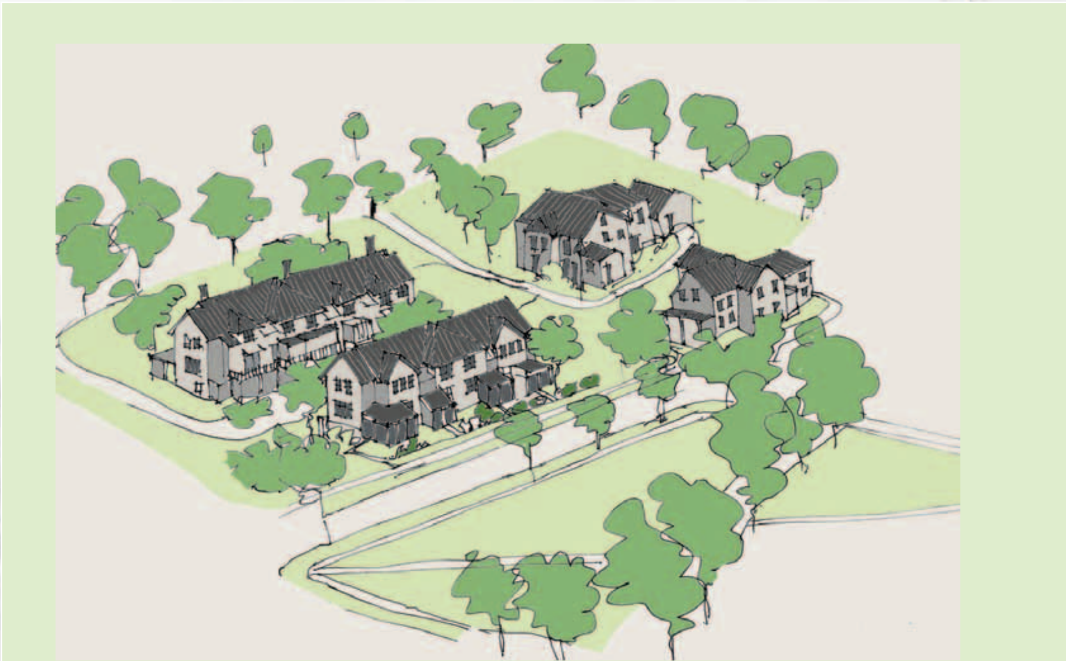
This bird's-eye view represents the area around letter C on the plan. Groupings of townhouses surround a central open space.