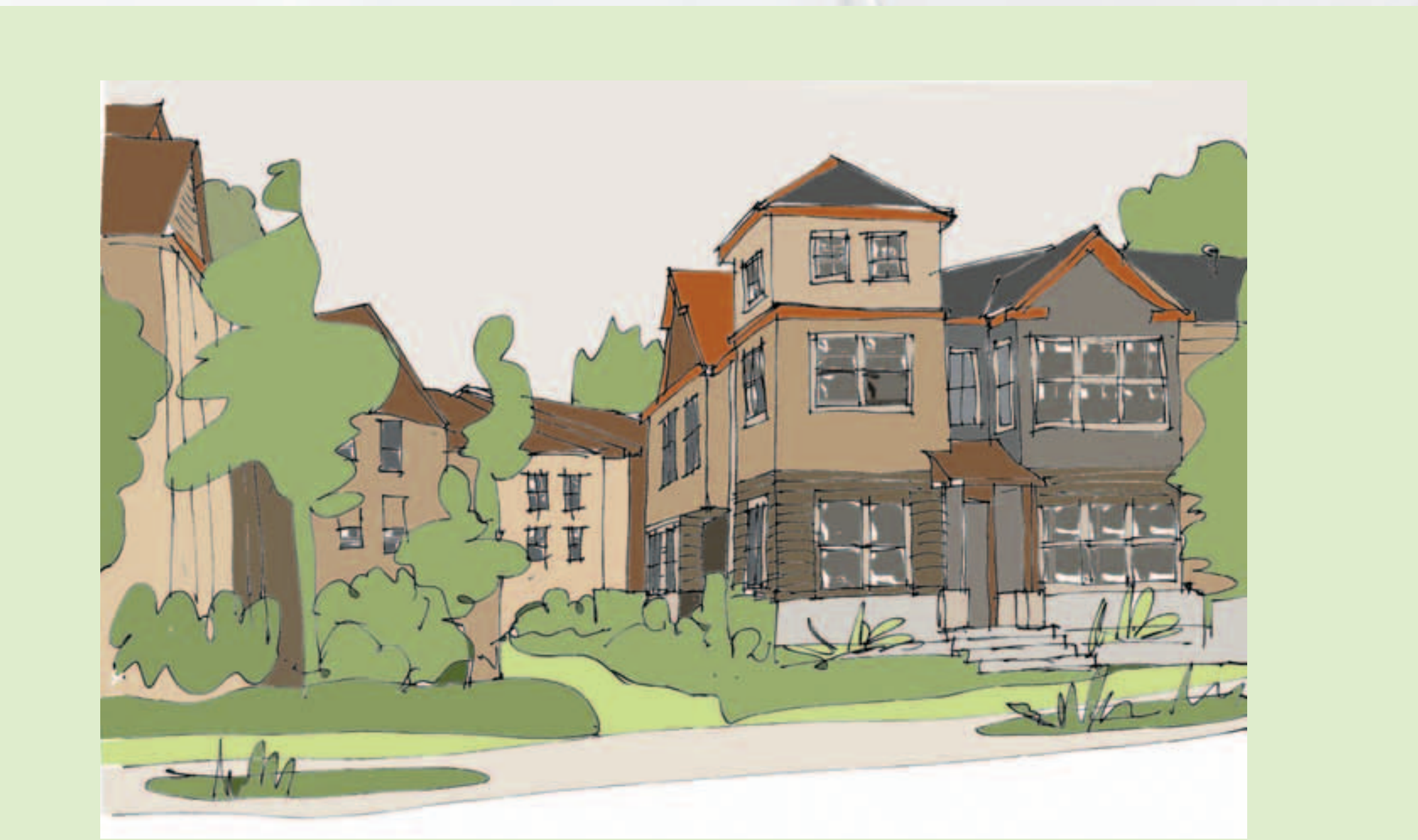
"Big houses" such as the ones illustrated above are designed to resemble single family homes while increasing density.

This design represents 150 housing units. The northern portion of the site features a series of 'big houses' and townhouses centered around a grassy open space. Land within 400' of the bluff line is preserved and restored with vegetation. Recreational trails allow access while minimizing the impact to the bluff. The open space falls into the following categories: (1) areas of high-quality vegetation, (2) areas of moderate quality vegetation, (3) restored area with open informal recreational space, trails, and scattered trees, and (4) restored grassland with scattered trees and trails.