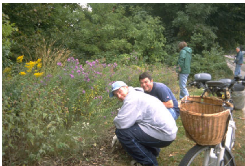
Augsburg students help remove weeds and woody invasive species at a planted prairie in the Seward neighborhood.