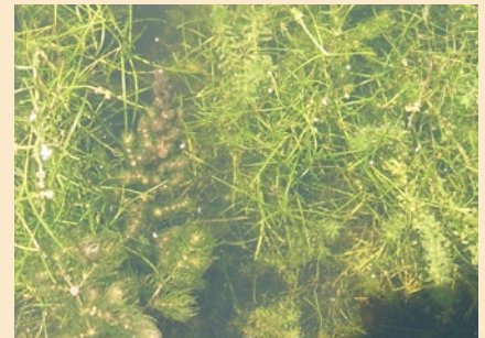
Clearer water allows sunlight to reach and grow desired plants.

Reducing sediment means improving water clarity. The MPCA and Wisconsin DNR believe this site specific standard will lead to an improvement in the aquatic ecosystem of the south metro Mississippi River, with benefits to fish, waterfowl and mussels, along with improved aesthetics and recreation.