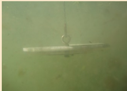
Sunlight cannot penetrate cloudy water to grow rooted vegetation.

Reducing sediment means improving water clarity. The MPCA and Wisconsin DNR believe this site specific standard will lead to an improvement in the aquatic ecosystem of the south metro Mississippi River, with benefits to fish, waterfowl and mussels, along with improved aesthetics and recreation.