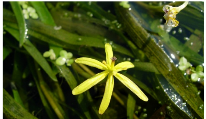
Stargrass, above, and other submersed vegetation benefit fish and wildlife but need clear water in which to grow. Achieving clearer water and beneficial vegetation is the goal of a standard proposed for the Mississippi River in the south Twin Cities area.

Public Comment Period: February 8 to March 26, 2010