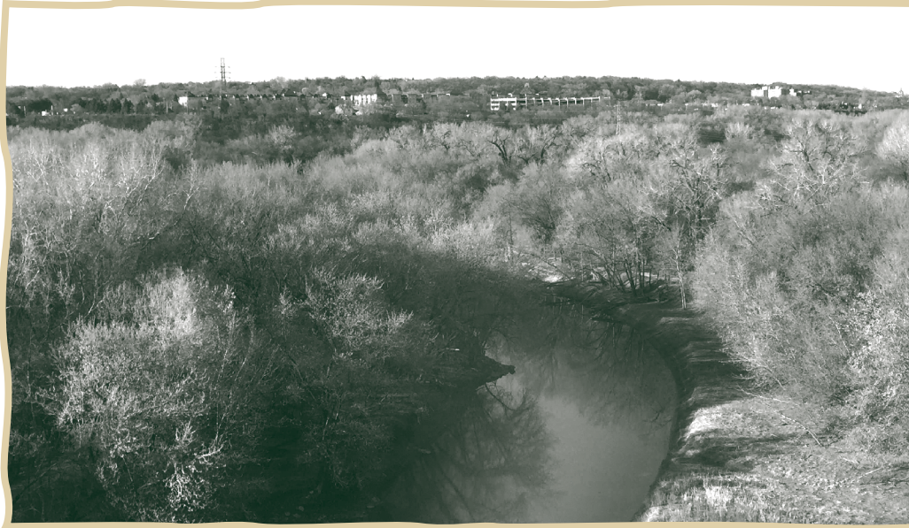
A view of the Shepard Davern site from the Mendota Bridge.

Many exciting developments along Saint Paul's riverfront occurred over the summer that will maintain scenic views, set river sensitive development guidelines and enhance the Saint Paul riverfront experience. FMR thanks Saint Paul staff, elected officials and community members for their work moving these great riverfront improvements forward.