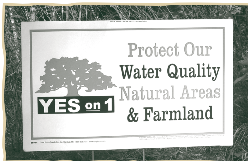
The 2002 Farmland and Natural Areas referendum in Dakota County raised $20 million for open space protection.

A similar measure in nearby Washington County had been narrowly defeated two years earlier, and FMR determined to heed the lessons of that failure. They set about organizing support and raising funds to hire a campaign manager. Their efforts paid off with approval of Minnesota's first countywide conservation referendum, passing by 14 percentage points despite growing anti-tax sentiment. Those local funds have been augmented by significant state dollars from the Legacy Amendment passed by Minnesota voters in 2008, as well as other legislative appropriations from the Environmental Trust Fund.