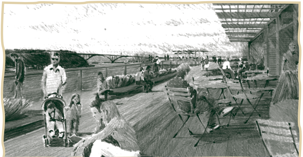
Artistic rendering of the proposed Saint Paul Riverfront Balcony by the Saint Paul Great River Passage Plan.

River Balcony Project: This fall, Saint Paul unveiled its plan to create a vibrant, multi-story, destination river balcony park that connects downtown to and along the Mississippi River. The plan includes pedestrian trails throughout; a passenger boat terminal connected to Union Depot; a destination brewery or restaurant space; an activated arcade; and other indoor and outdoor gathering spaces. Public input is now being gathered to further this vision that grew out of Saint Paul's Great River Passage Plan. Stay tuned!