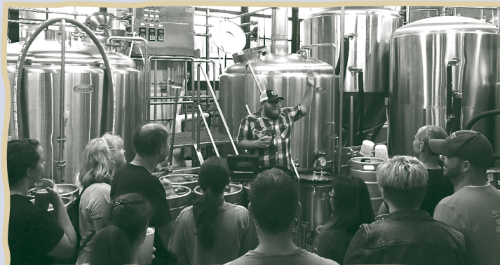
Volunteers enjoy a post-stenciling beer and brewery tour at Tin Whiskers.

These innovative partnerships are helping us tap in to the momentum of the fast-growing craft brewery movement to develop and nurture an informed base of beer lovers who take action to protect and preserve clean water throughout the Twin Cities metro area.