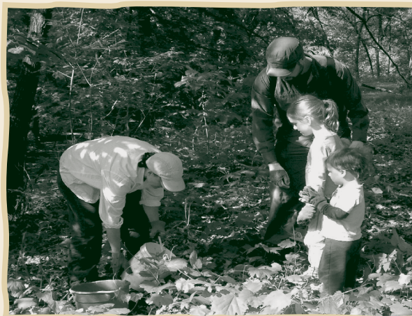
Volunteers planting native species in the Oak Savanna.

But even with all those efforts, the native plant communities that have been established on the site are still at risk, as the Oak Savanna is an island surrounded by invasive species in both the river parks and adjacent neighborhoods. To address this, FMR is working with both volunteers and professional work crews to buffer the Oak Savanna by removing invasive species at the north and south ends of the sites and replace them with native species.