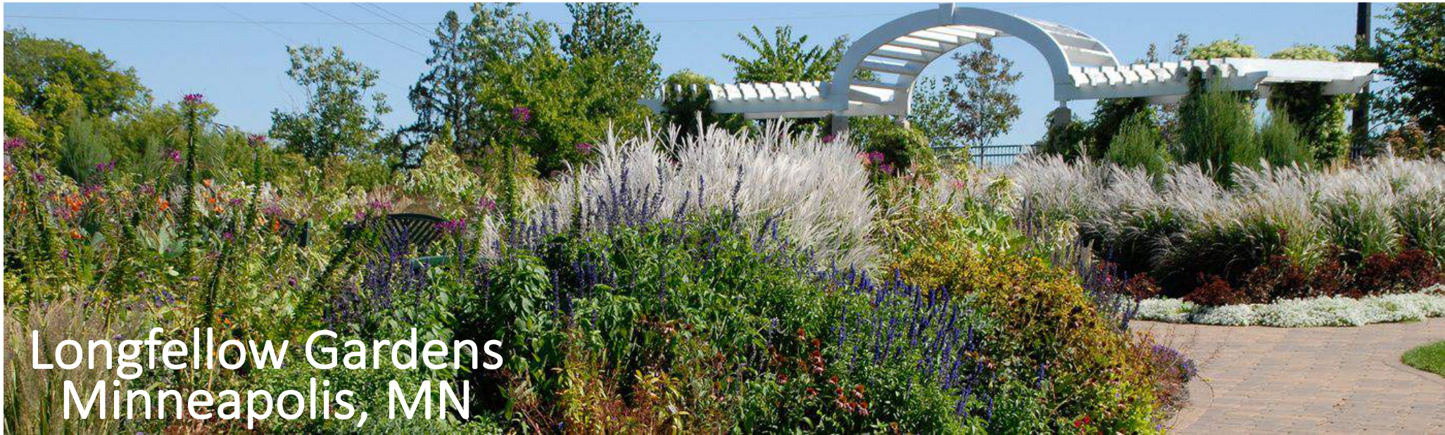
Longfellow Gardens Minneapolis, MN