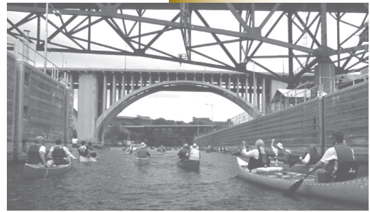
2004 Challenge paddlers leaving the Upper St. Anthony lock.