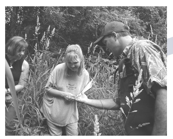
Volunteers study aquatic plants in an Apple Valley wetland as part of a wetland monitoring project.